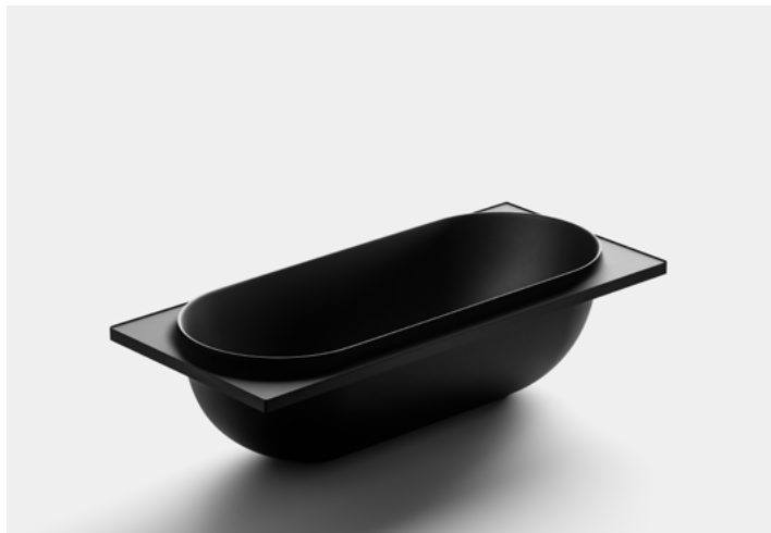
● PIO/TITO TOSO DOME BATHTUB