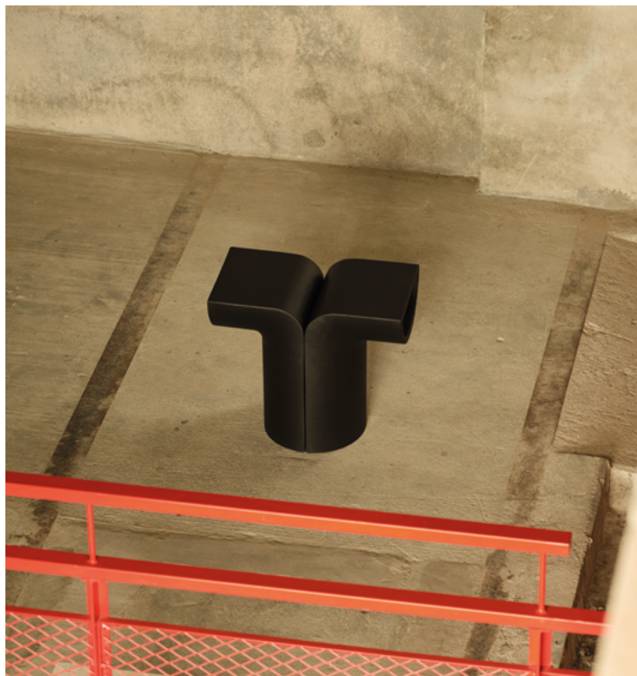
● DEBONADEMEO ANTHOS