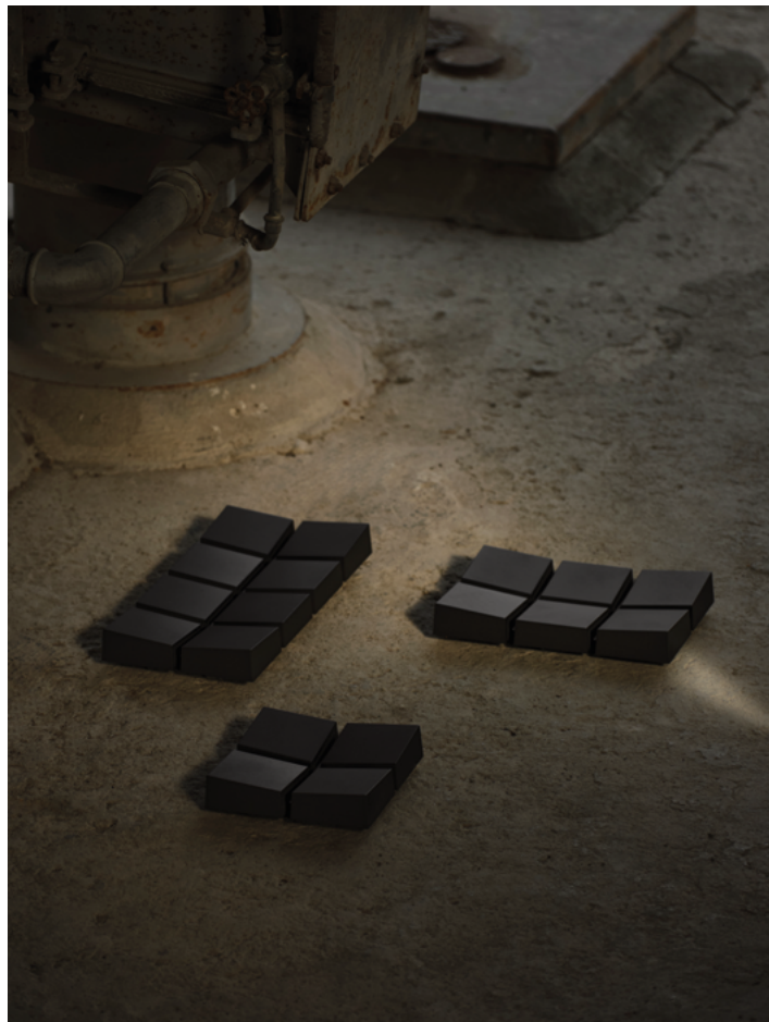
● FINEMATERIA TILES