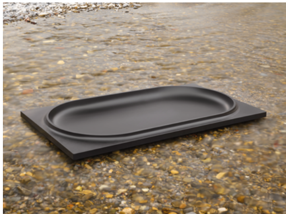
● PIO/TITO TOSO DOME SHOWER TRAY